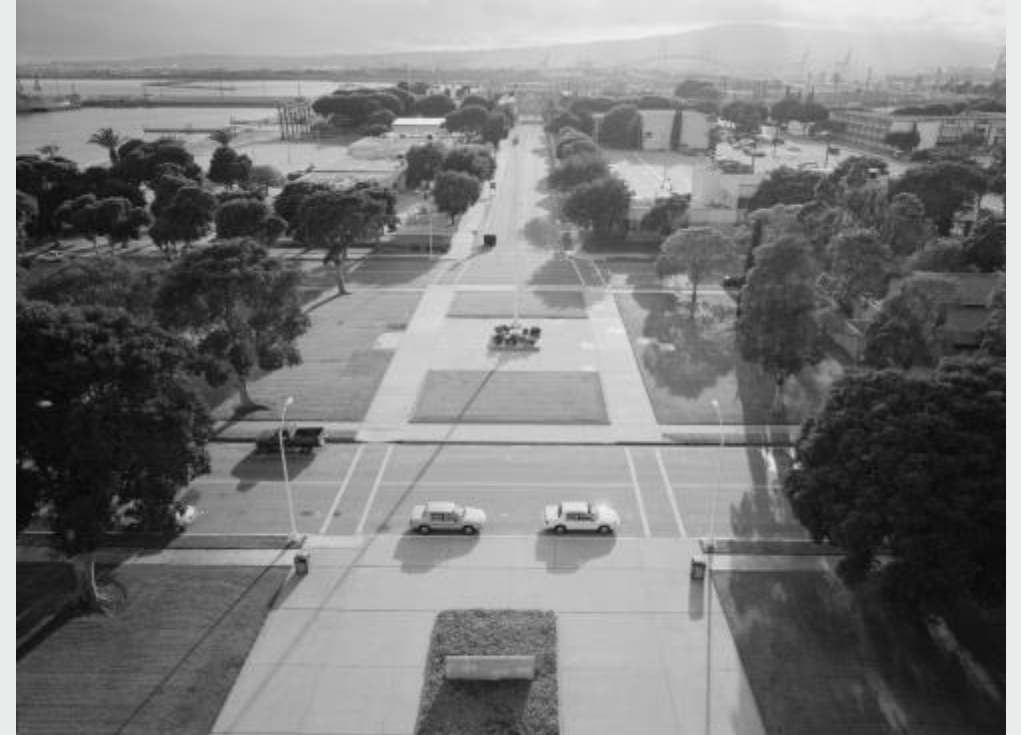
Roosevelt Naval Base, facing NE