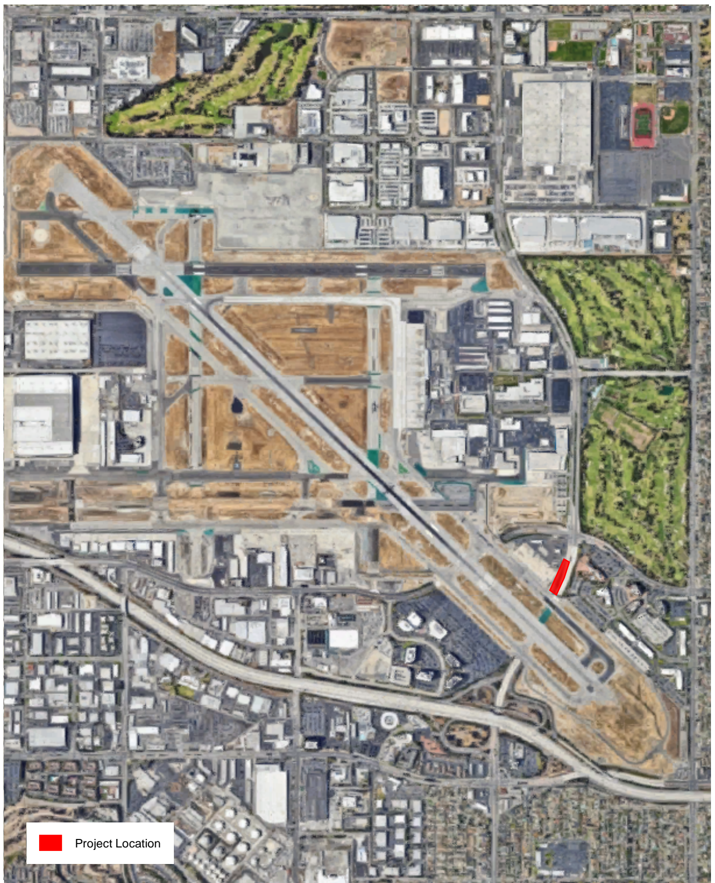
Project Location Map Long Beach Airport Gateway Sign